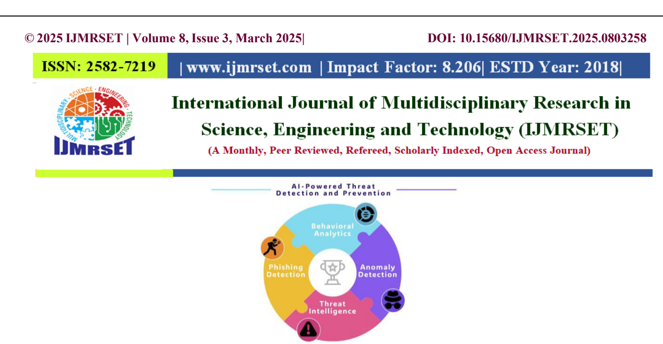
Al-driven continuous monitoring and threat-hunting is a strong Al cybersecurity strategy that significantly helps to avoid data breaches and cyberattacks.

AI-driven threat detection relies on various techniques, including supervised learning, unsupervised learning, and reinforcement learning, to identify potential risks. Supervised learning models use historical data to classify threats, enabling AI to recognize previously encountered attack patterns. Unsupervised learning helps in anomaly detection by identifying deviations from normal behaviour, allowing security systems to detect zero-day attacks and insider threats. Reinforcement learning enhances cybersecurity by continuously improving decision-making processes, enabling AI to adapt to new attack tactics and refine its response strategies. Deep learning models, particularly Convolutional Neural Networks (CNNs) And Recurrent Neural Networks (RNNs), are used for analysing network traffic, identifying fraudulent activities, and detecting Advanced Persistent Threats (APTs). Natural Language Processing (NLP) plays a significant role in phishing detection, helping AI systems analyse email content, website URLs, and fraudulent messages to prevent social engineering attacks.